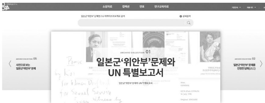
Figure 4: Collections of Archive 841

The next step for Archive 814 is to continue to collect and archive materials, documents, photos as well as other related items concerning women’s human rights and peace. One of the objectives of the Archive 814 is to create a platform to raise awareness and increase people’s interest in not only the “comfort women” issue but also violence against women and women’s human rights. Moreover, one of the other important objectives of Archive 814 is to attempt to create a digital archive from a feminist perspective, which is challenging as technology oriented digital archiving itself is relatively male dominated 15) .