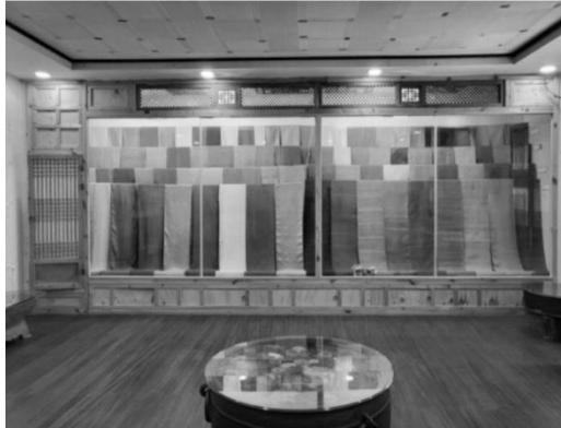
Figure 7: Textile Exhibition at the Women's Life History Museum