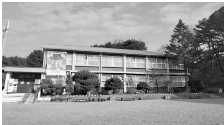
Figure 6: Women’s Life History Museum

Museums were originally created to house the spoils of colonization, therefore, most exhibitions at museums are masculine or gender blind in nature, as women’s realm was considered to a private sphere, which has no “historical value”. However, since the 1980s, there has been a significant movement concerning the establishment of women’s museums, and in 2008, the first ever International Women’s Museums Congress (IWMC) was hosted in Italy, which led to the founding of the International Association of Women’s Museum in (IAWM) 2012. The movement toward a creation of a museum from a women’s perspective was also prevalent in Korea, which led to the opening of several women related museums since the early 2000s. This section will examine the various women’s museums in Korea, the purpose of these museums and the move toward the creation of a “national” women’s museum in Korea.