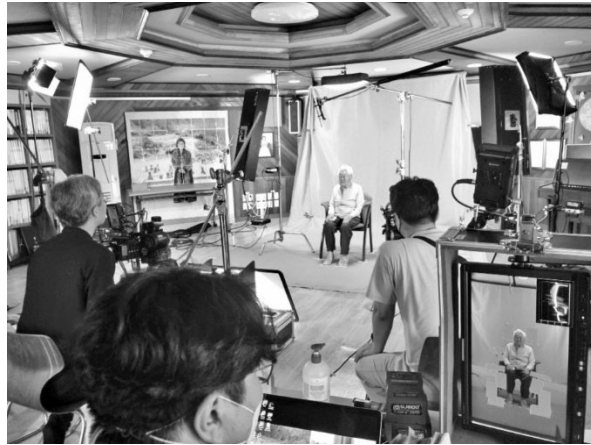
Figure 2: Photo of the recording session 11)

was also effective in educating young people about the holocaust, therefore, the “Eternal Testimony” provides yet another example to utilize technology to provide innovative ways to provide education to our young generation 10) .