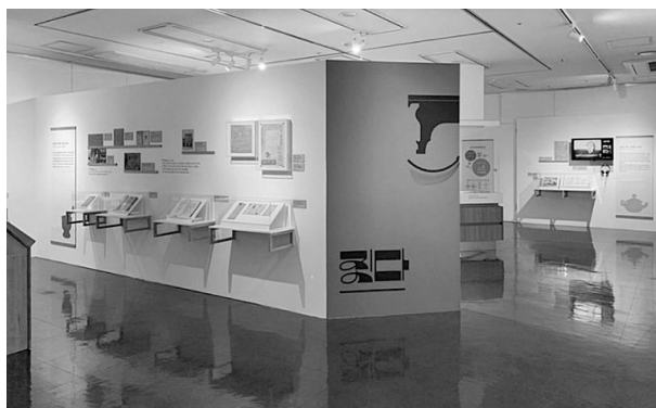
Figure 9: Permanent Exhibition at the National Women's History Exhibition Hall