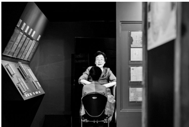
Figure 3: Photo of the Hologram and Digital Testimony 12)