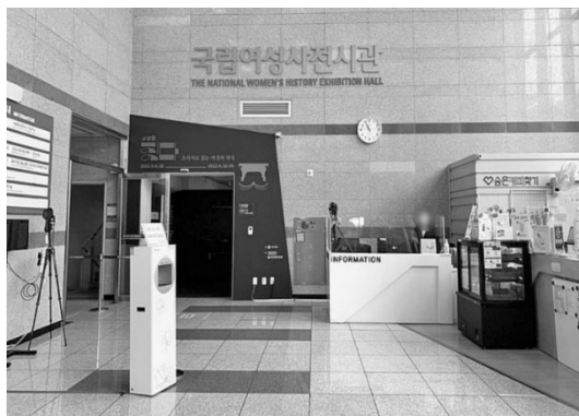
Figure 8: National Women's History Exhibition Hall